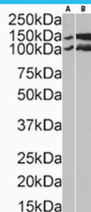
Anti-E Cadherin [19A11]. WB of MCF7 and Caco-2 cells lysate with Ab03204.